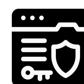
Multi-protocol VPN (IPSec/GRE/VXLAN)