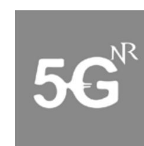
5G NR Sub-6 Bands NSA/SA, NR-CA