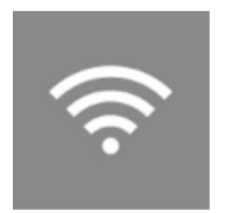
802.11b/g/n/ax Wi-Fi 6