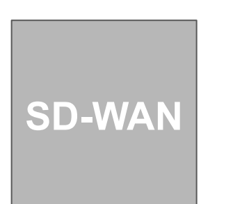
Software-Defined Wide Area Network